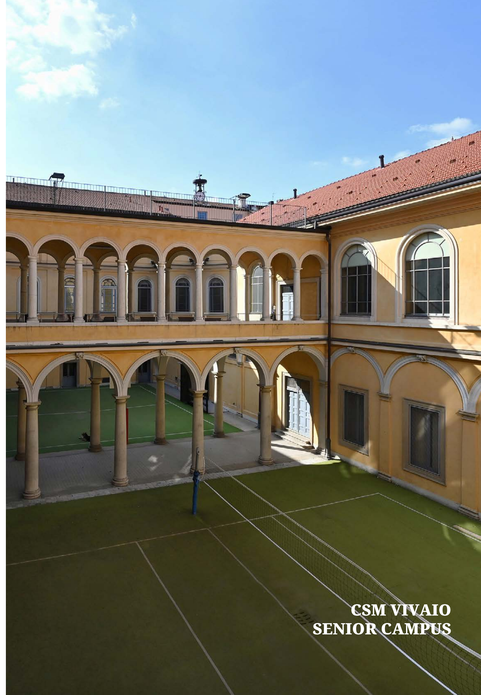
CSM VIVAIO SENIOR CAMPUS