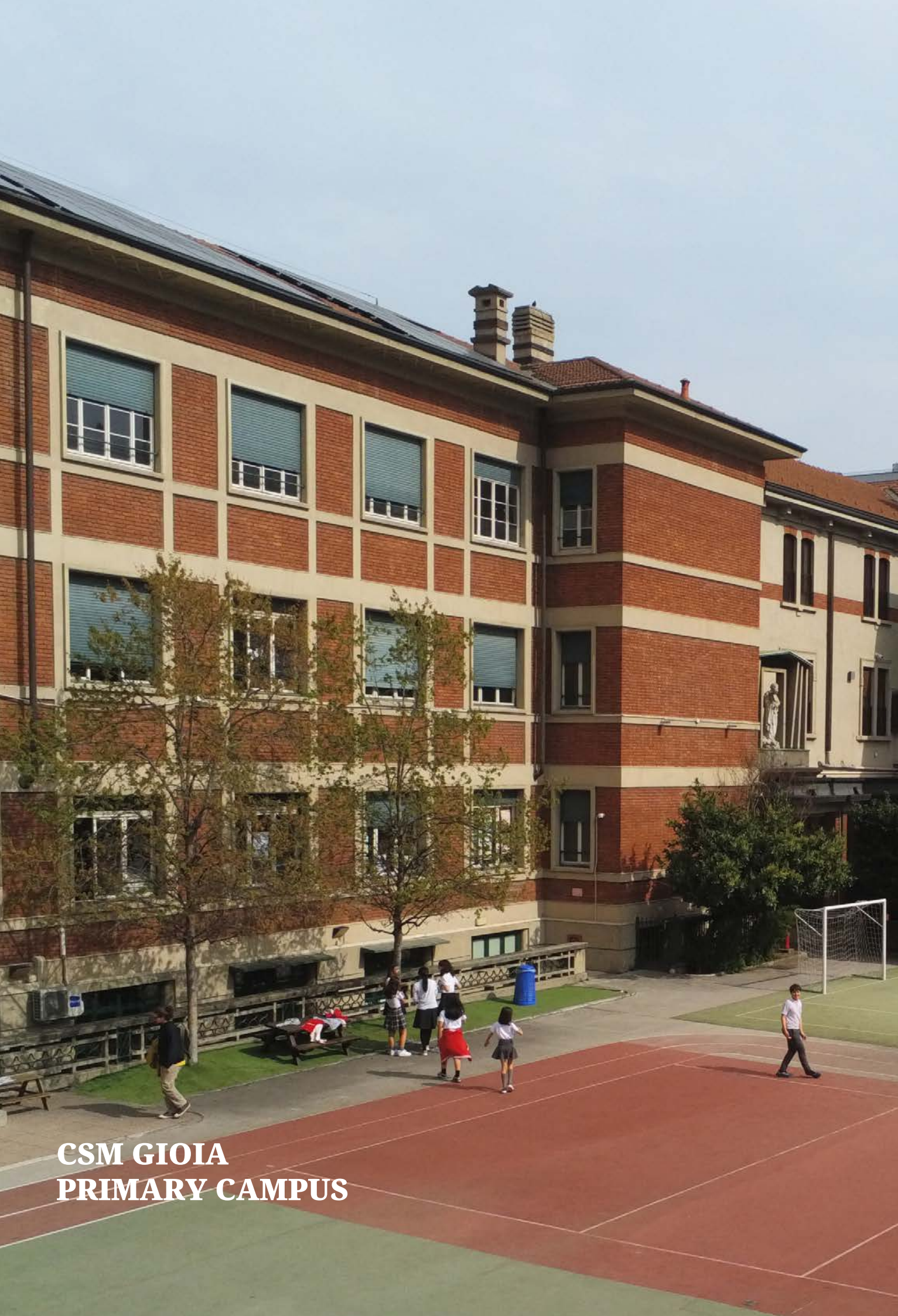
CSM GIOIA PRIMARY CAMPUS